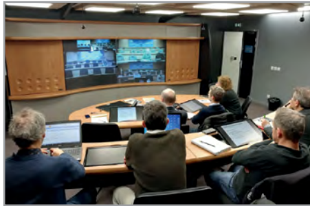
First meeting of the working group across 5 cities (Brest, Lannion, Lorient, Rennes, Vannes).

A working group to democratize data and services from Copernicus and make Brittany a territory for experimentation and demonstration of space applications.